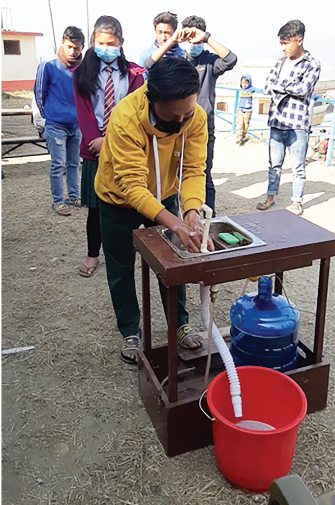
Handwashing unit in use at Bhotenamlang school

It performed well (phew) and survived the very rough and bumpy journey in the back of the “jeep” to and from the remote hills (bravo!).