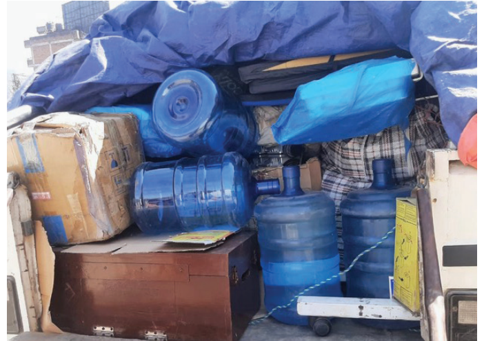
Handwashing unit loaded in the Jeep

The PPF will work with the Dhulikhel Hospital team to identify sites for the trialling and evaluation of these units. The PPF will then develop a business model for the ongoing fabrication and distribution of the units in Nepal.