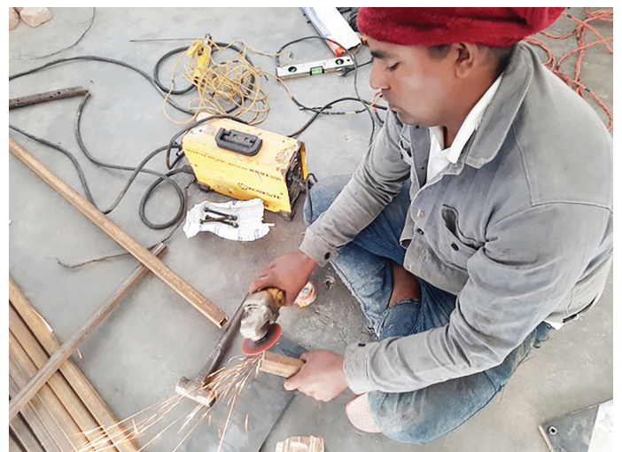
Welding process for the unit's frame