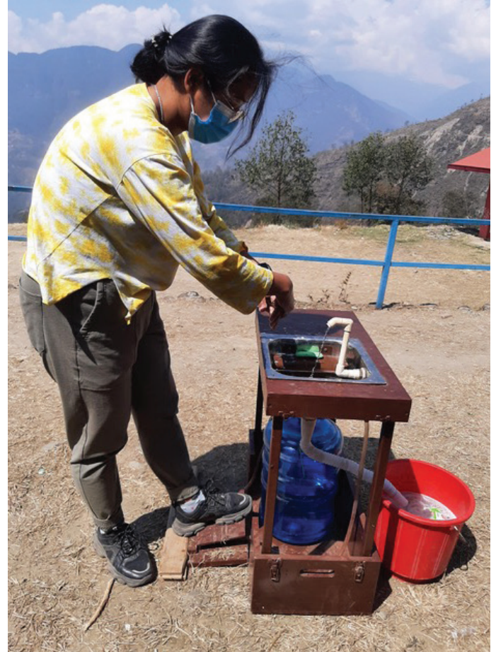
Handwashing unit in use at Bhotenamlang school