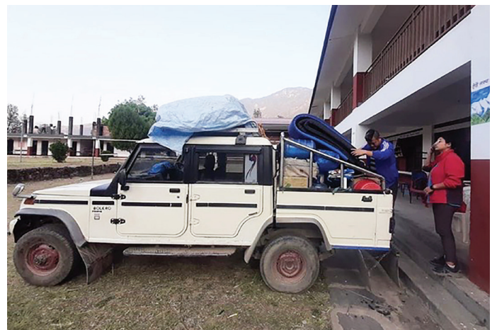
Unloading the dental gear and the handwashing unit