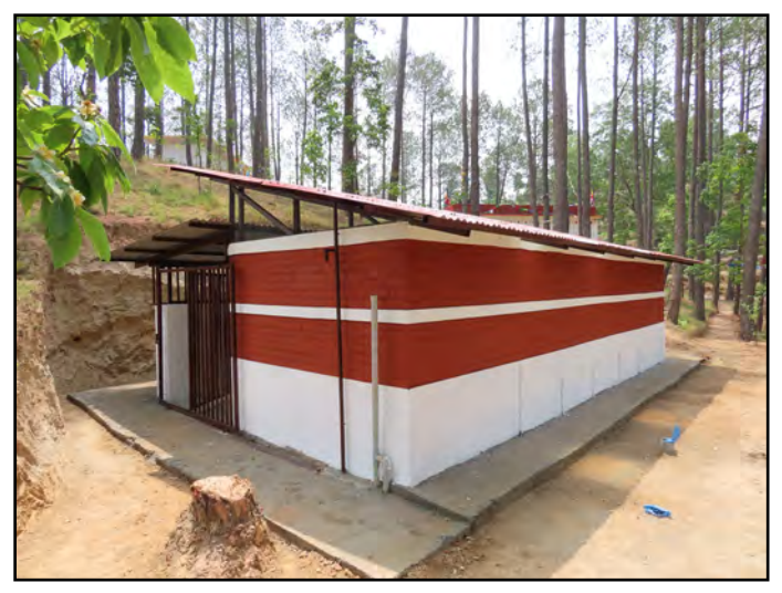
Completed sanitation block