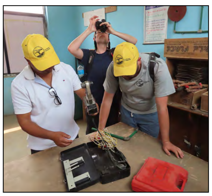
PPF Team training workshop in Nepal