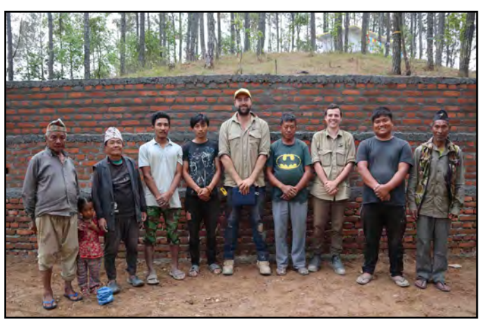
Plumbing and construction team onsite

However, he arrived smiling and with several more Facebook friends. The team settled in to the village and work life, and took some time to visit a plumbing training college near the Indian border where a copy of the Nepal Plumbing Regulations was useful reading.